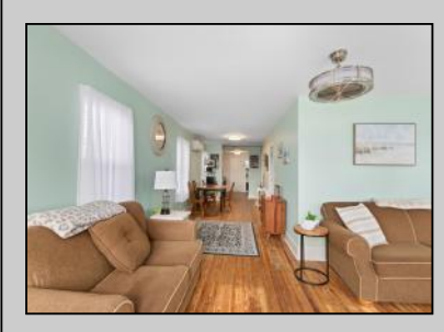
239 Delaware Villas, NJ 08251