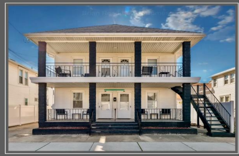
238 E Leaming Avenue #6 Wildwood, NJ