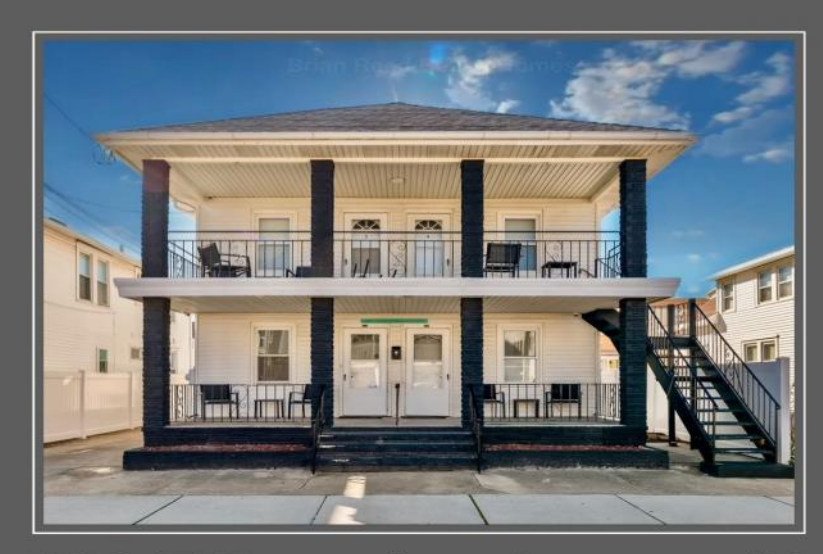
238 E Leaming Avenue #6 Wildwood, NJ