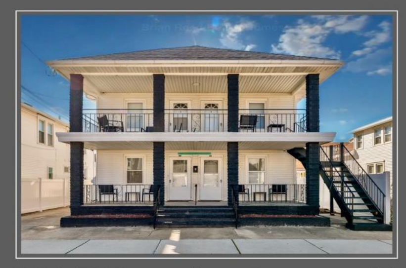
238 E Leaming Avenue #6 Wildwood, NJ