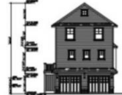
4 REAR ELEVATION SCALE 1/8" = 1'-0"