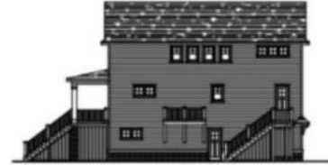
2 RIGHT SIDE ELEVATION SCALE 1/8" = 1'-0"