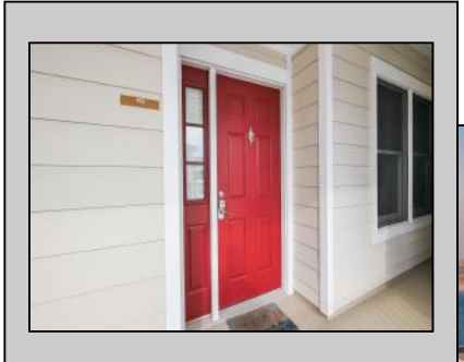
101 Spruce North Wildwood, NJ 08260