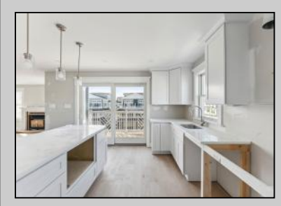
116 Columbine Wildwood Crest, NJ 08260