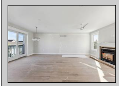
116 Columbine Wildwood Crest, NJ 08260