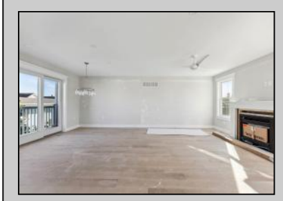
116 Columbine Wildwood Crest, NJ 08260