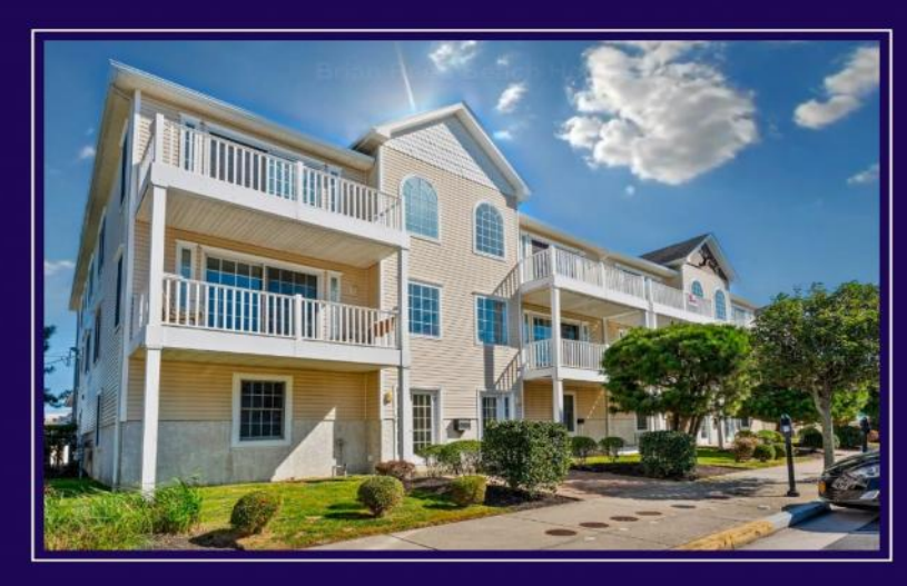
301 E Leaming Avenue Wildwood, NJ