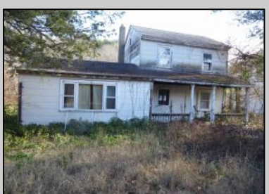
878 Route 47 South Dennis, NJ 08210