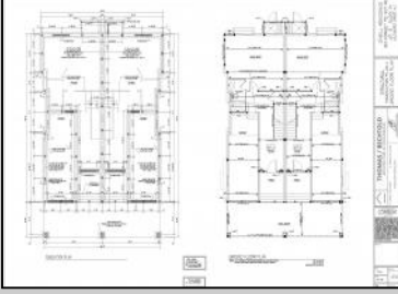
104 Forget Me Not Wildwood Crest, NJ 08260