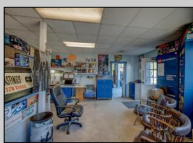
449 Route 47 S Green Creek, NJ 08219