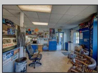
449 Route 47 S Green Creek, NJ 08219