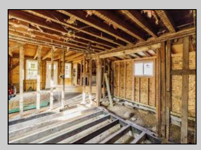
884 Route 47 N South Dennis, NJ 08210