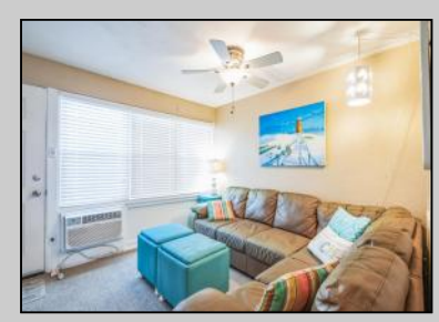
422 4th North Wildwood, NJ 08260