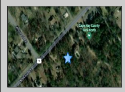
1113 Route 9 S Palermo, NJ 08223