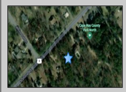
1113 Route 9 S Palermo, NJ 08223