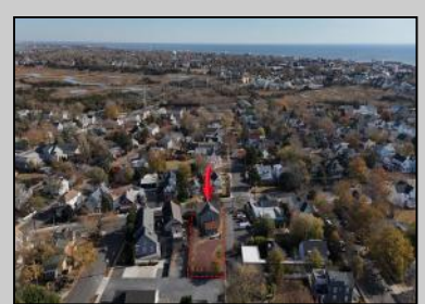
414-416 Broadway West Cape May, NJ 08204