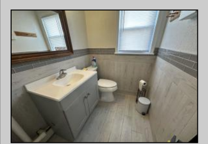
5400 Pacific Wildwood Crest, NJ 08260