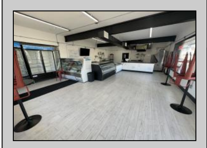
5400 Pacific Wildwood Crest, NJ 08260