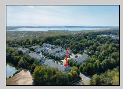
100 Osprey Cape May Court House, NJ 08210