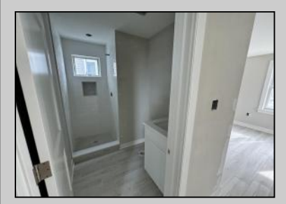
4420 Park Sea Isle City, NJ 08243