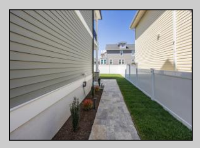
1904 Atlantic North Wildwood, NJ 08260