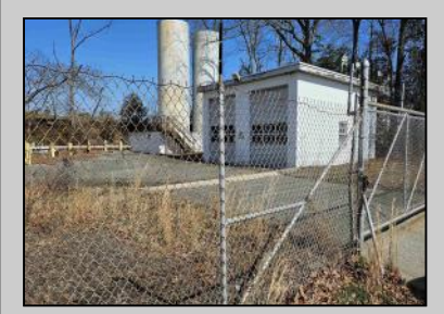
99 Mays Landing Somers Point, NJ 08244