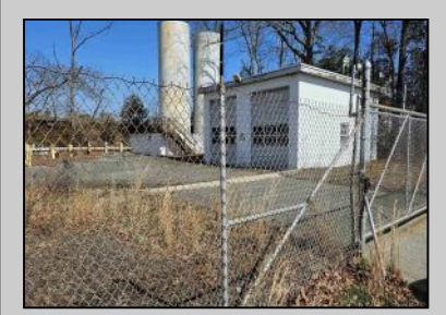
99 Mays Landing Somers Point, NJ 08244