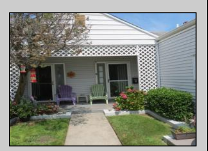
213 25th North Wildwood, NJ 08260