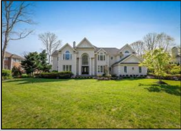
10 Caledonia Seaville, NJ 08230