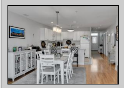
301 Rochester Lower Township, NJ 08260