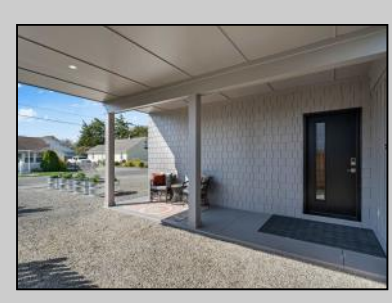
5 Hazelwood Villas, NJ 08251