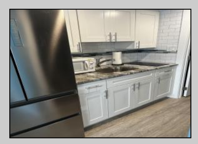
301-309 Ocean North Wildwood, NJ 08260