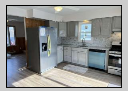
208 Village Villas, NJ 08251