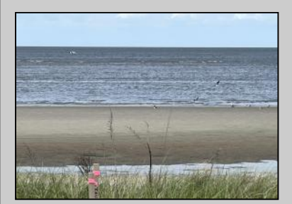
11 Delaware Del Haven, NJ 08251