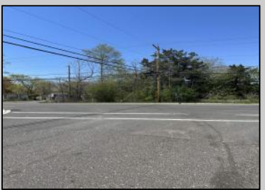
2504 Route 9 Rio Grande, NJ 08242