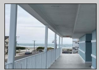
301-309 Ocean North Wildwood, NJ 08260