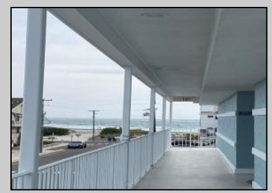
301-309 Ocean North Wildwood, NJ 08260