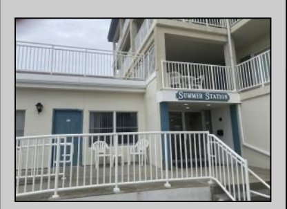
217 Beach Cape May, NJ 08204