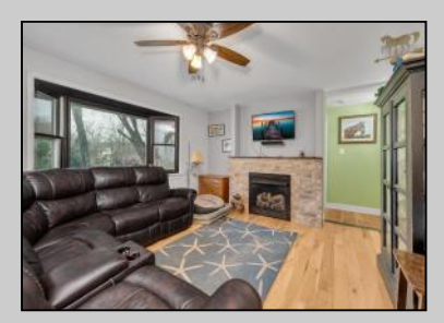
716 Dias Creek Cape May Court House, NJ 08210