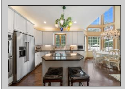
39 Dory Cape May Court House, NJ 08210