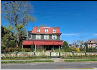
933 Washington Cape May, NJ 08204