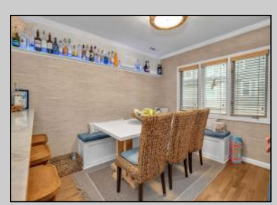
301 South Station Lower Township, NJ 08260