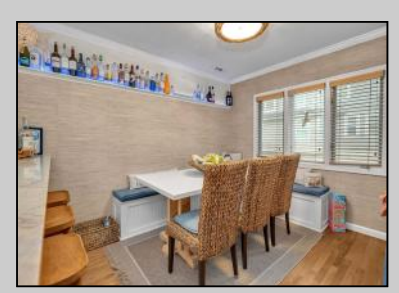
301 South Station Lower Township, NJ 08260