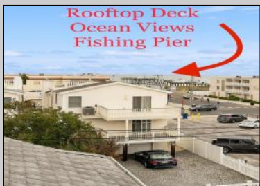
Rooftop Deck Ocean Views Fishing Pier