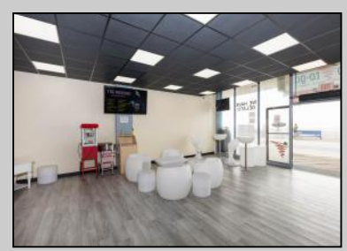
5318 Boardwalk Wildwood, NJ 08260