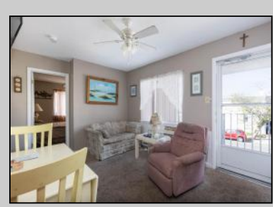
5407 Pacific Wildwood Crest, NJ 08260