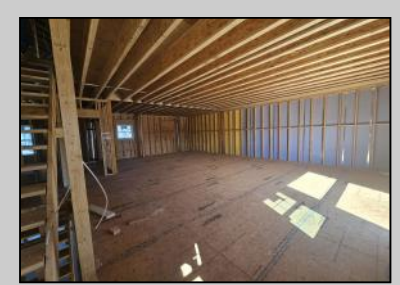
2410 New York North Wildwood, NJ 08260