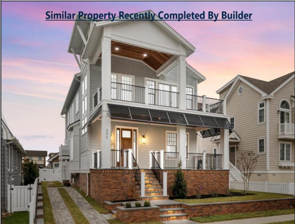
Similar Property Recently Completed By Builder