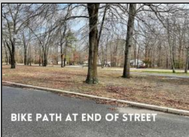
BIKE PATH AT END OF STREET