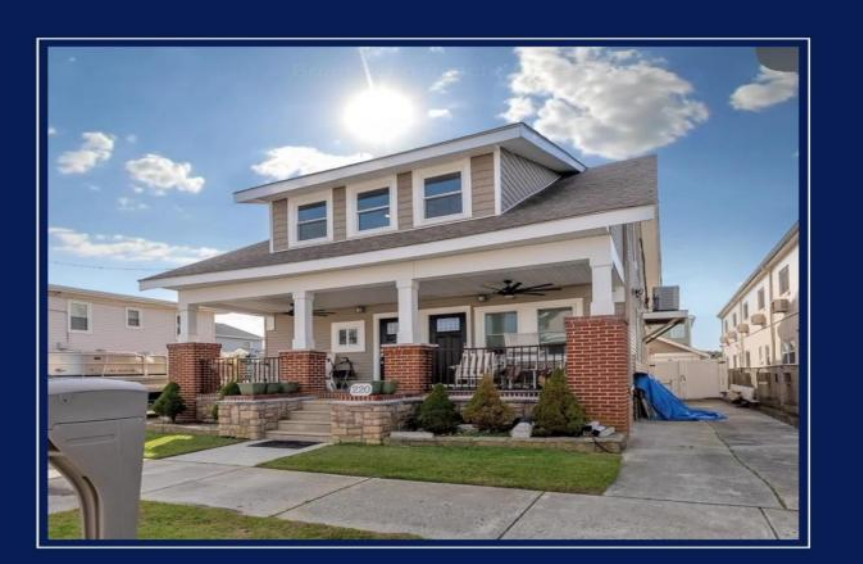
220 E 21ST AVENUE North Wildwood, NJ 8 Bedroom Duplex