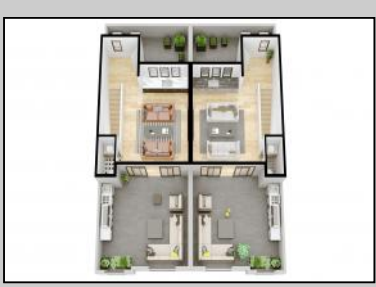
418-20 Farragut Wildwood Crest, NJ 08262